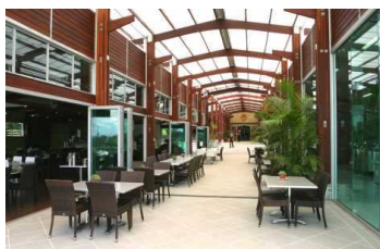
Witches Chase Cheese

Over the last few months we have been rapt to be back in Queensland for workshops. Our first ever sheep's milk workshop at Towri Sheep Cheesery was highly successful and we were so impressed with the newly opened facilities at Witches Chase Cheese in Mt Tamborine. The new venue is right in the centre of town with a restaurant, coffee shop, cheese factory and beer brewery.